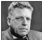
Dr. Alfred Kinsey The father of the sexual revolution