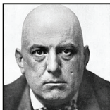
Aleister Crowley British satanist and pedophile