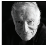
Hugh Hefner The father of the modern pornography movement